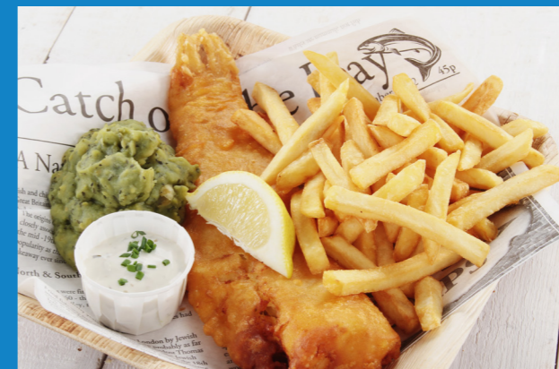
Beach games & fish n chips Activity cost $15