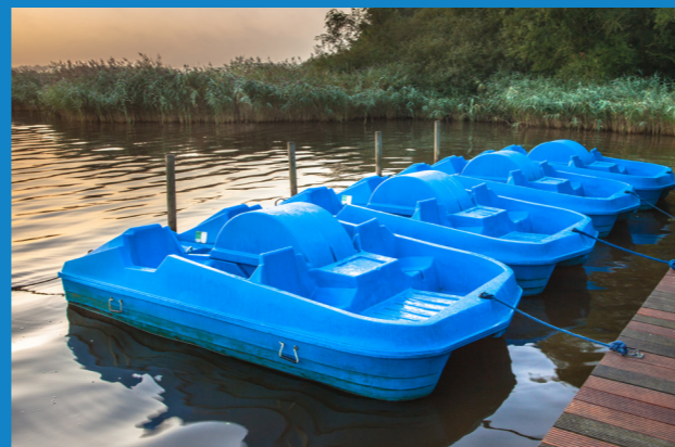
Paddle boating at Jack Evans Activity cost $15