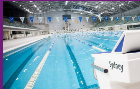
Swimming Activity cost $11