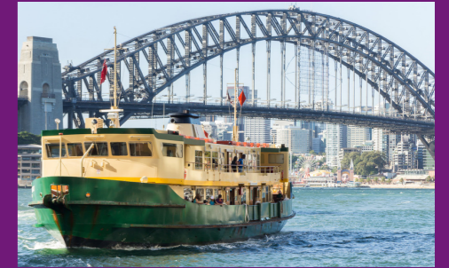
A trip to the city to visit the Opera House and lunch in the park Activity cost $15 (Coffee or lunch) Participants can bring a packed lunch or buy lunch