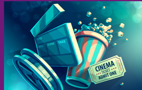
Movies Activity cost $20