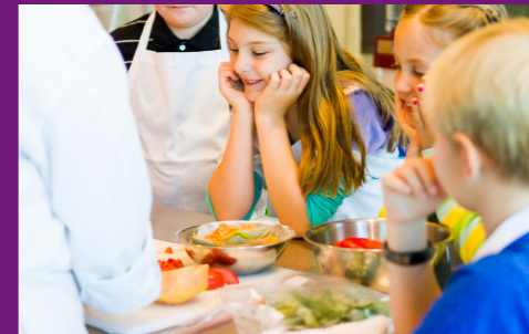
In-centre cooking Activity cost $15