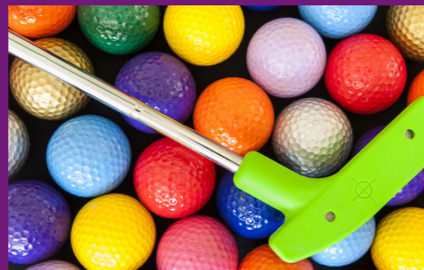
Putt Putt Golf (Liverpool Catholic Club) Activity cost $11