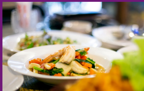
Cafes & restaurants Activity cost $22