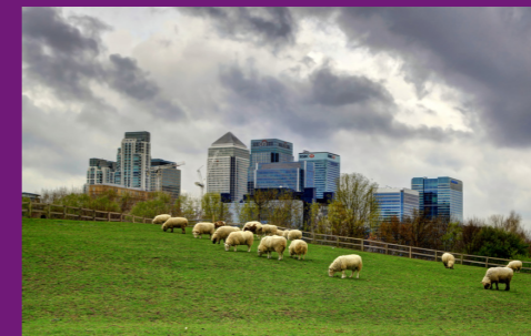
Fairfield City Farm Activity cost $23.50 (with concession card)

Start the conversation today and contact our friendly Client Engagement Team T 1300 588 688 E enquiries@sunnyfield.org.au www.sunnyfield.org.au