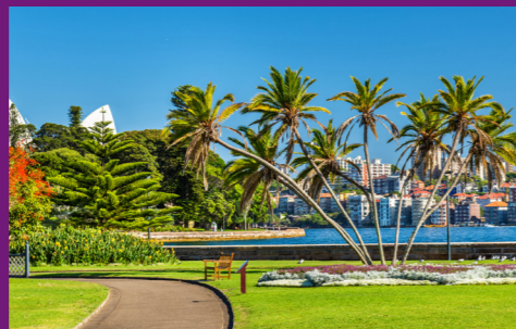
Mount Anna Botanical Gardens Activity cost $Free