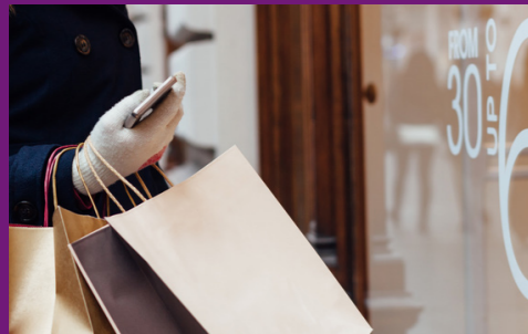
Xmas Shopping Activity cost $5