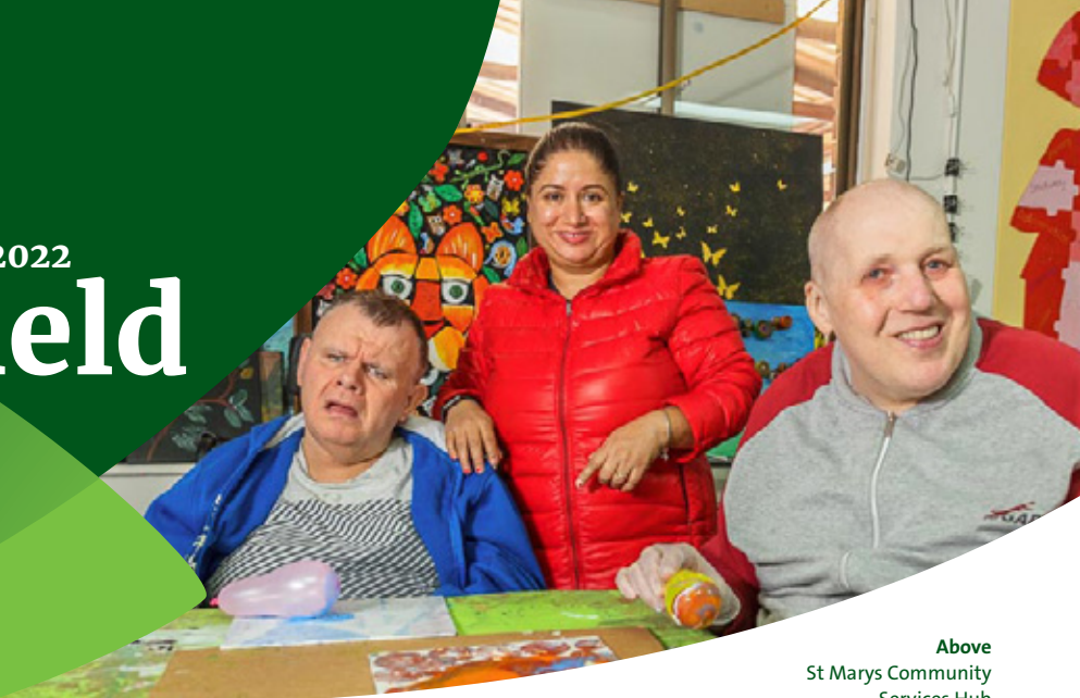
Above St Marys Community Services Hub