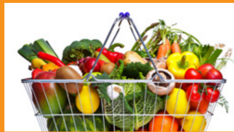
Shopping (Meal planning)