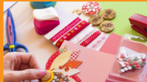
Gardening and Scrapbooking