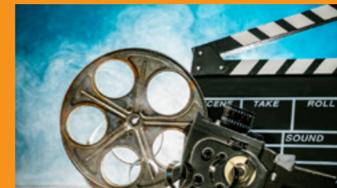
Movies and Stocking