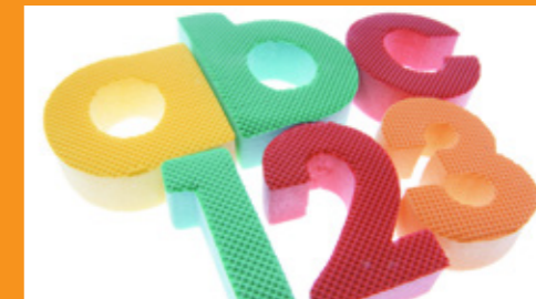
'Skills for Life' – Literacy and Numeracy

Start the conversation today and contact our friendly Client Engagement Team on 1300 588 688. Guildford Community Services Hub 11 – 25 Byron Road Guildford. www.sunnyfield.org.au