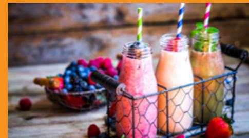
Smoothies and Group Activity