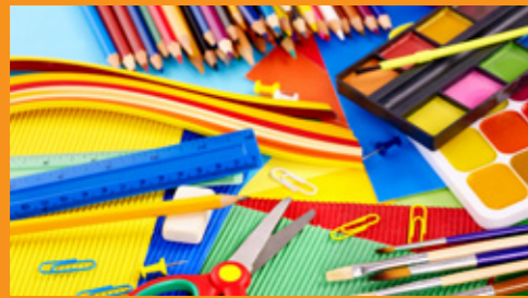
Arts and Craft