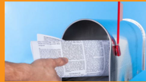
Newspaper folding and delivery