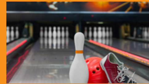
Bowling and a visit to the local park