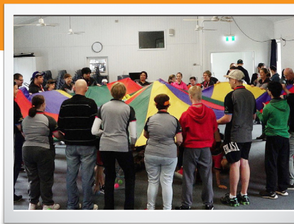
Sunnyfield's annual sports camp is a highlight each year