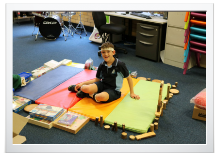
The Learning Tree and School holiday program at Tamworth has new resources

Thank you to every donor for making a difference in the lives of people with disability