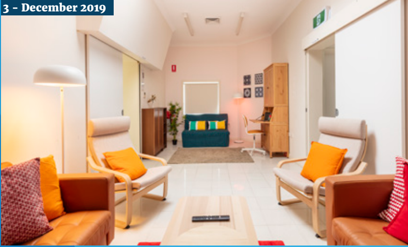
3 - December 2019