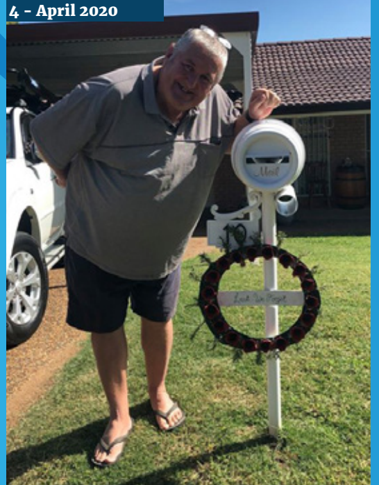
4 - April 2020