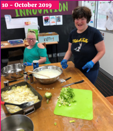
10 - October 2019