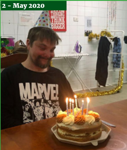
2 - May 2020