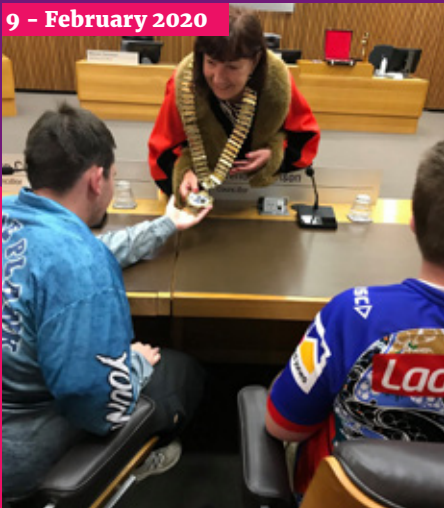
9 - February 2020