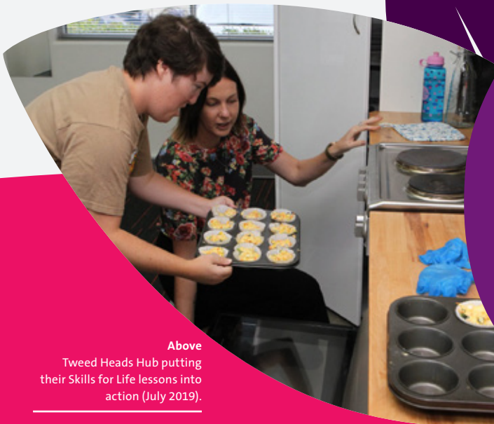
Above Tweed Heads Hub putting their Skills for Life lessons into action (July 2019).