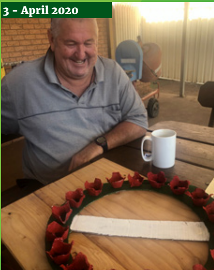
3 - April 2020