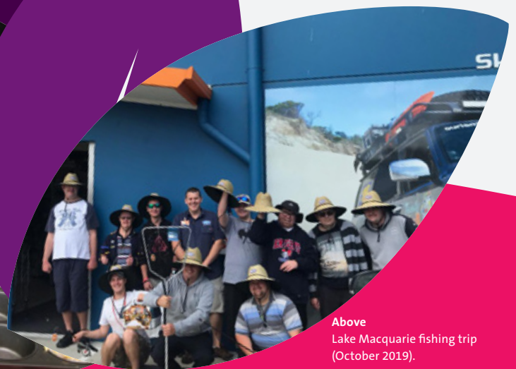
Above Lake Macquarie fishing trip (October 2019).

I HAVE LIKED DOING ALL THE DIFFERENT THINGS AT THE HUB LIKE MAKING BATH BOMBS, WALKING EVERY DAY, LAVA LAMPS, BUTTON BOWLS