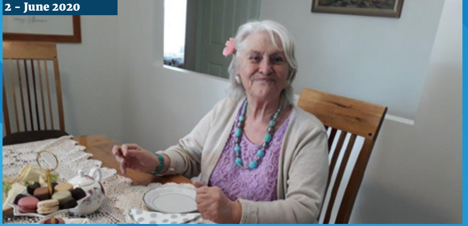
2 - June 2020