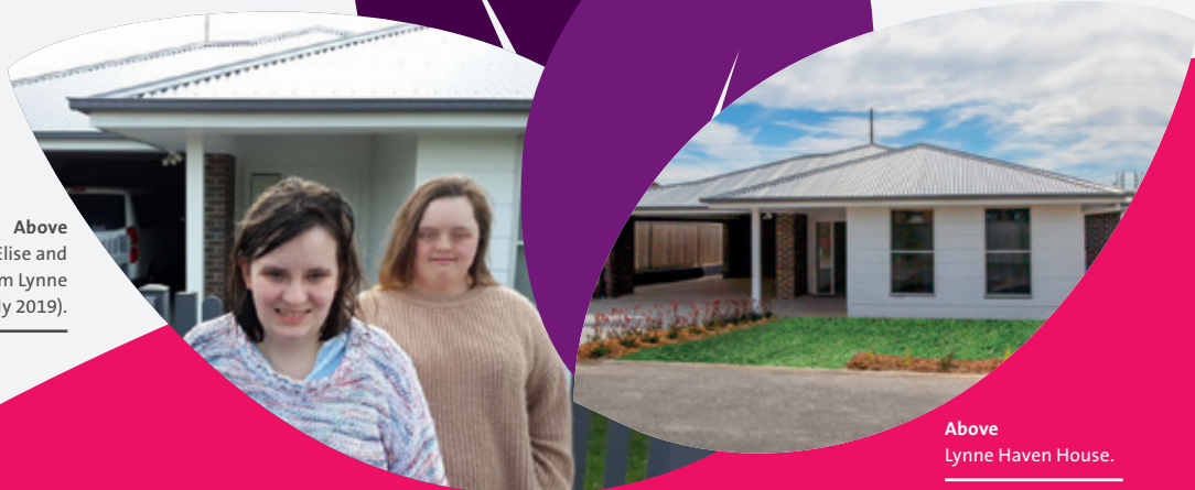
Above Lynne Haven House.

I LIKE LIVING HERE WITH MY FRIENDS. THEY ARE MY BEST FRIENDS