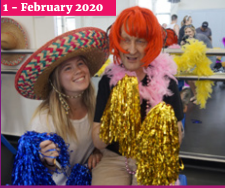
1 - February 2020