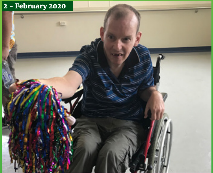
2 - February 2020