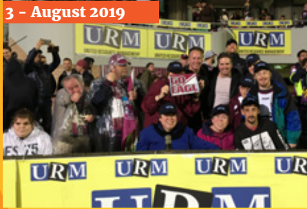
3 - August 2019