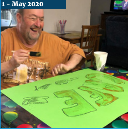
1 - May 2020