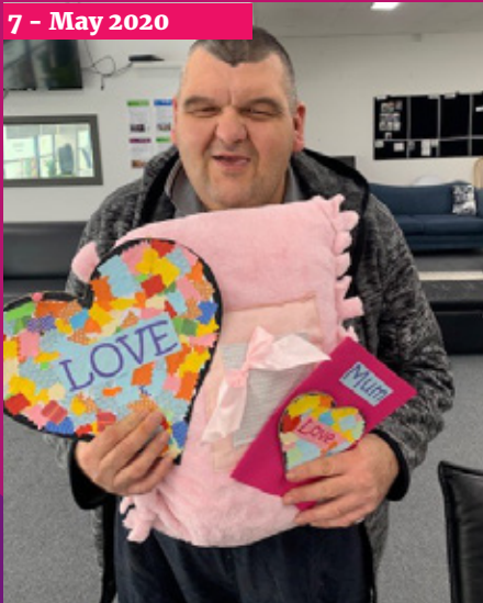
7 - May 2020