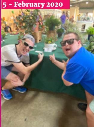
5 - February 2020