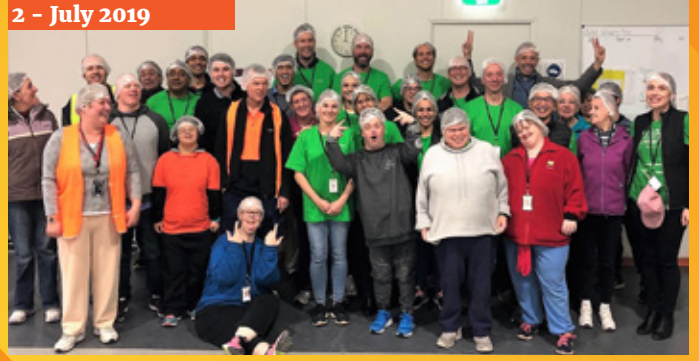
2 - July 2019