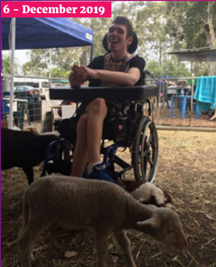
6 - December 2019