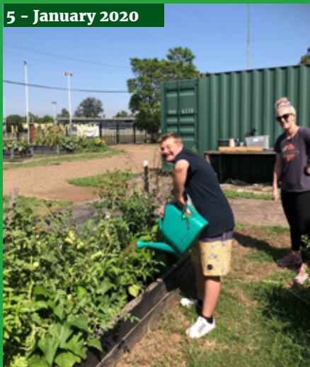
5 - January 2020