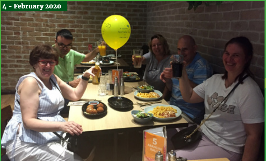
4 - February 2020