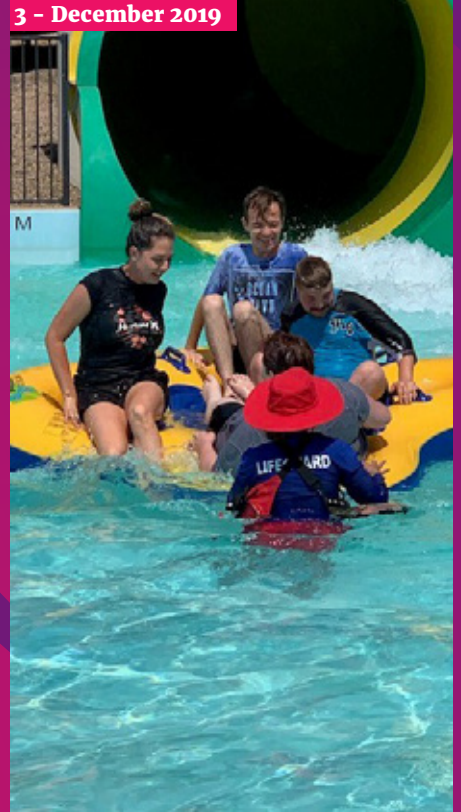
3 - December 2019