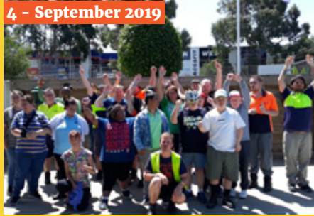
4 - September 2019