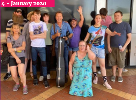
4 - January 2020