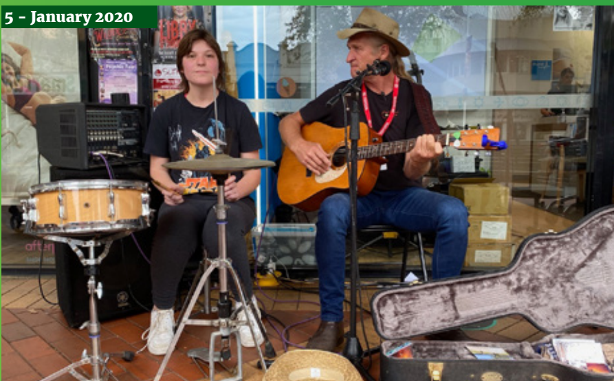
5 - January 2020