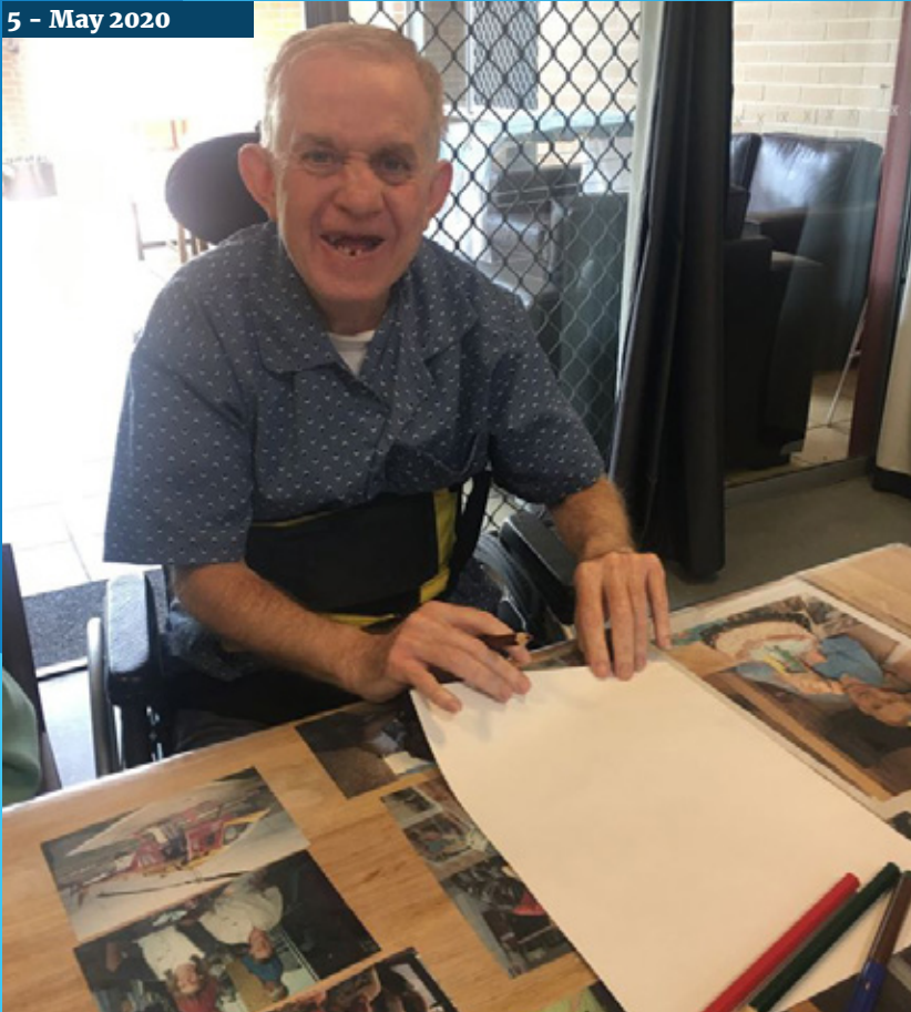
5 - May 2020