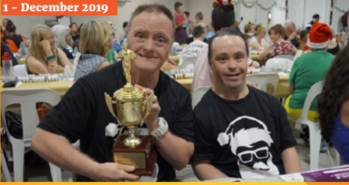
1 - December 2019