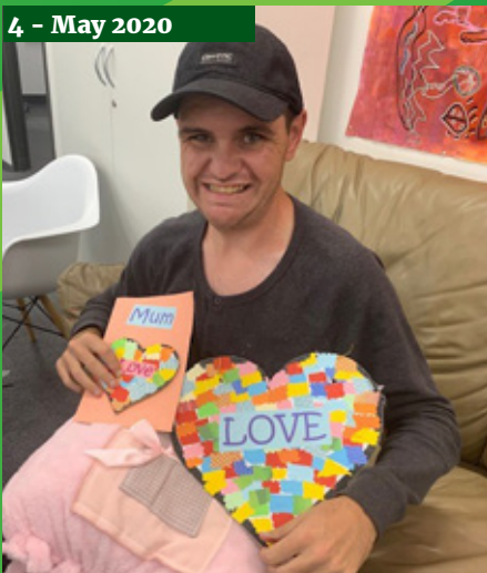
4 - May 2020