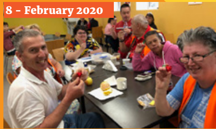
8 - February 2020