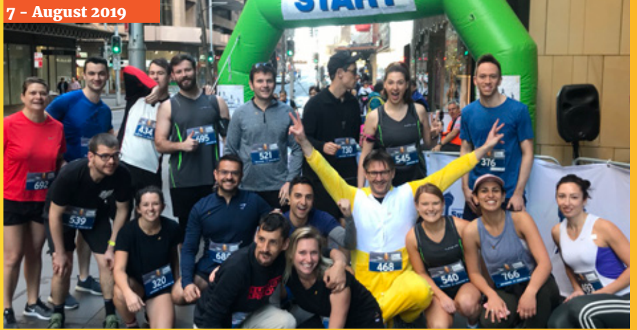
7 - August 2019