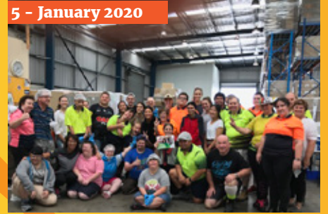
5 - January 2020