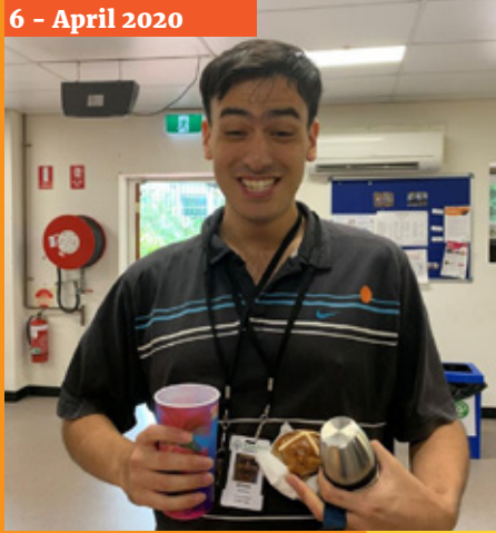
6 - April 2020