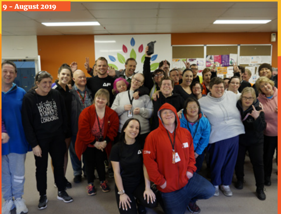
9 - August 2019