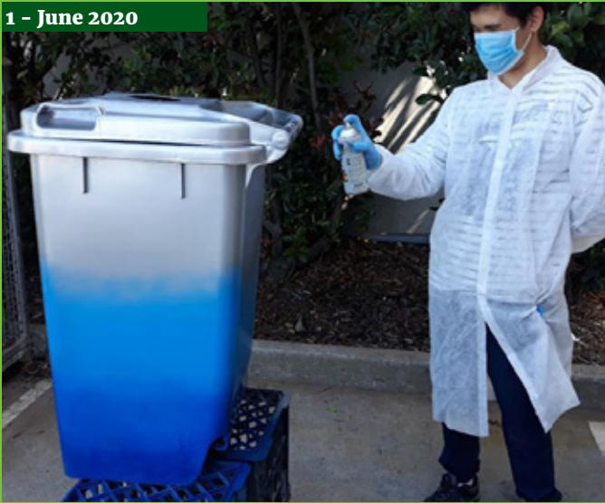
1 - June 2020