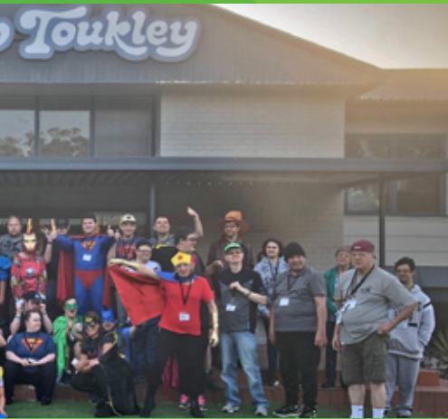
3 - December 2019