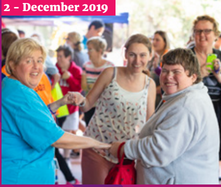
2 - December 2019