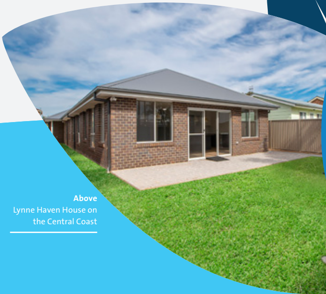
Above Lynne Haven House on the Central Coast