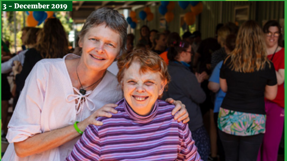
3 - December 2019