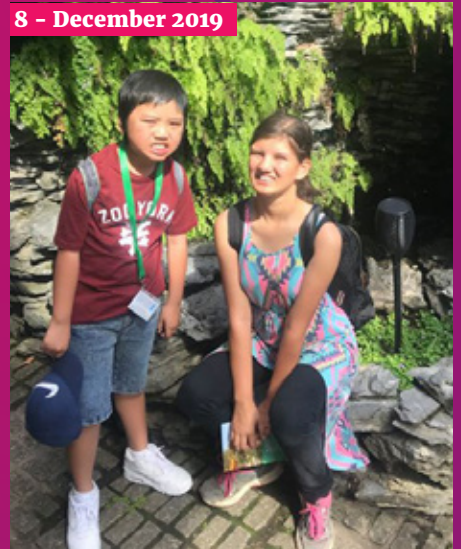
8 - December 2019