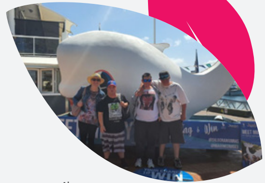
Above Maitland Hub clients go whale watching in Port Stephens (October 2019).

We support people with disability to access community, social, recreational, and capacity building activities; delivered in a Sunnyfield hub, a person's home, or out and about in the community. We have regular scheduled programs, or can develop personalised service programs. And we are committed to ensuring what we do meet the individual needs of each person with disability who asks for our support, so they can achieve their goals.