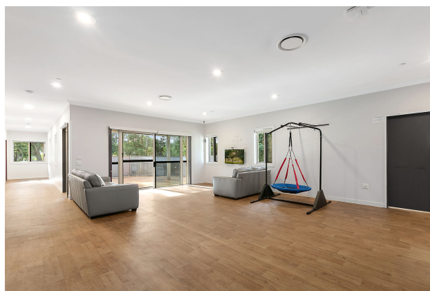
Spacious open plan living area