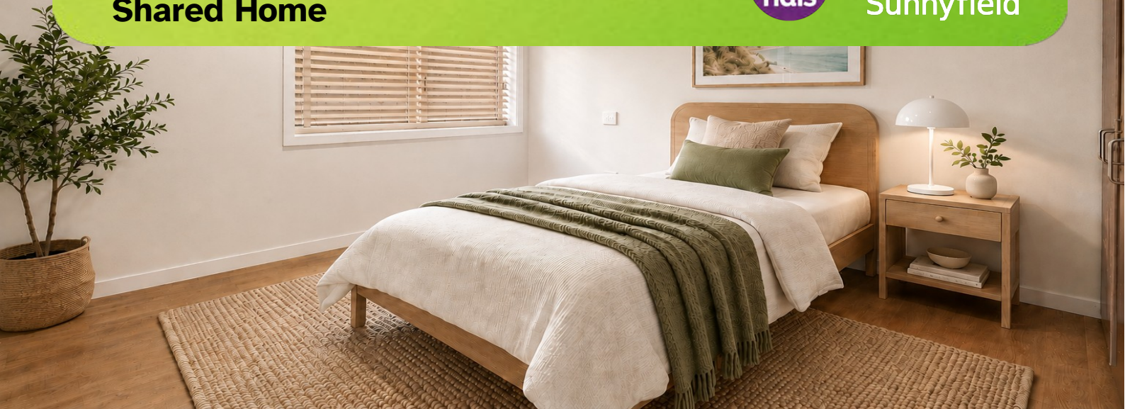
Vacant bedroom (virtually styled)