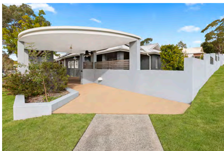
Front of house