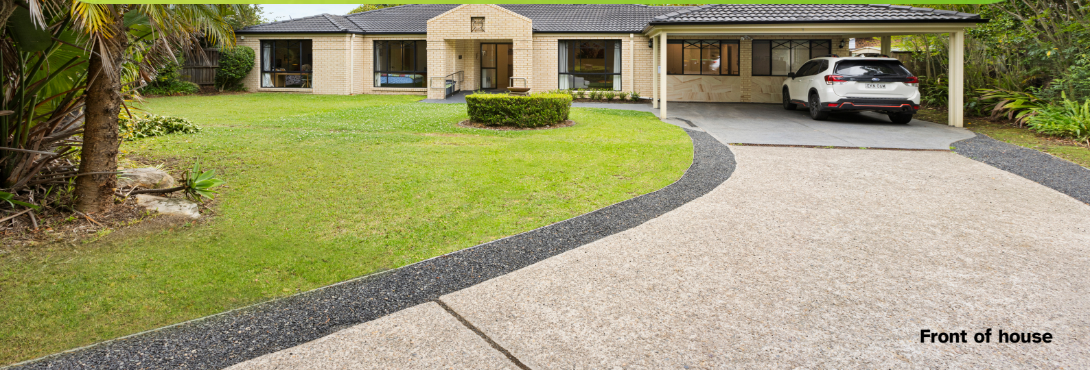
Front of house