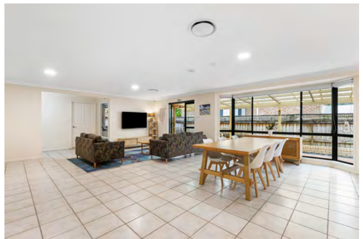
Shared living space