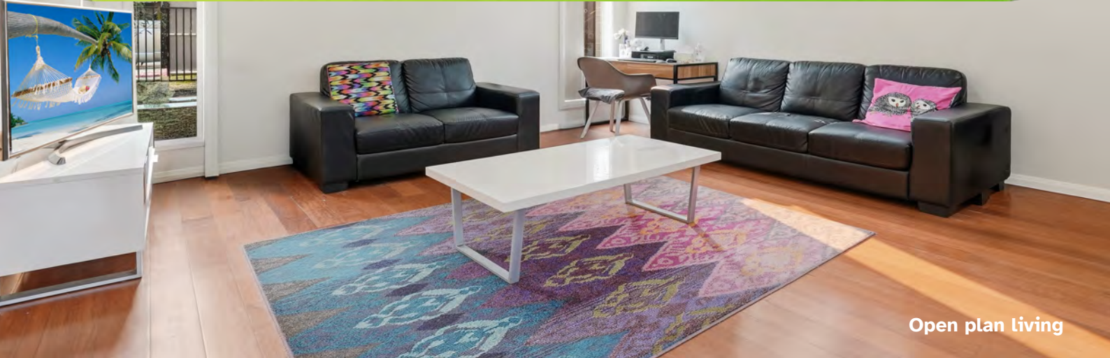
Open plan living