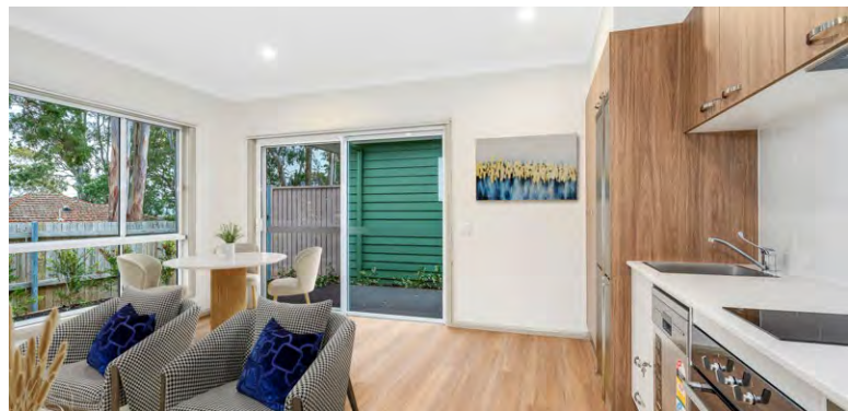
Open plan living (villa 8E)