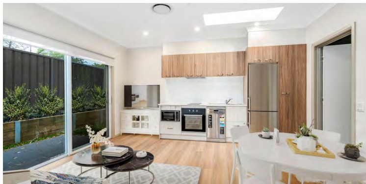
Open plan living (villa 8B)